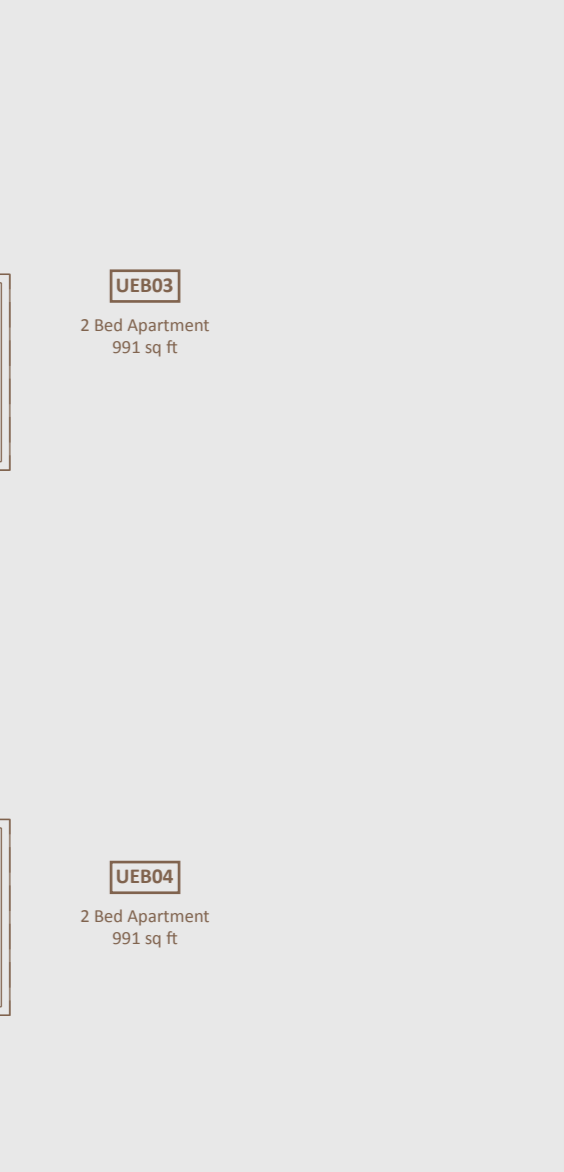
UEB04 2 Bed Apartment 991 sq ft