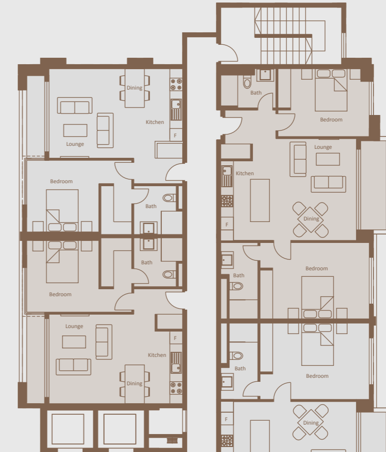
UEB01 1 Bed Apartment 678 sq ft