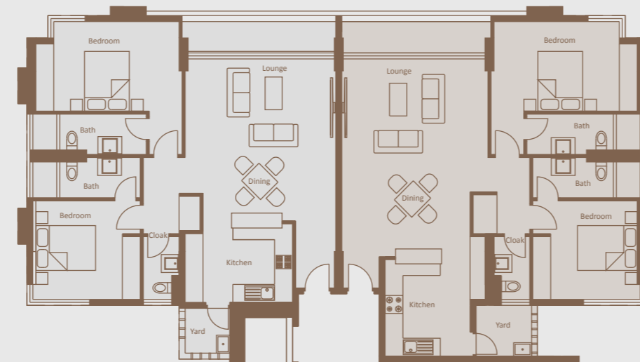
UEA02 2 Bed Apartment 1173 sq ft