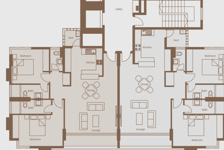
UEA04 2 Bed Apartment 1124 sq ft